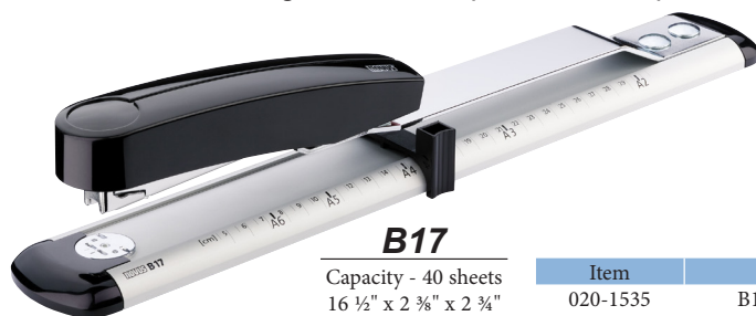
B17 Capacity - 40 sheets 16 ½" x 2 ¾" x 2 ¾"

the ideal device for stapling across large documents, binding booklets, and everyday stapling.