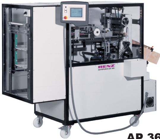
AP 360 (digital)

AP 360, MOBI 500 and AB 500 machines are made in Germany, and are engineered of quality heavy gauge metals.