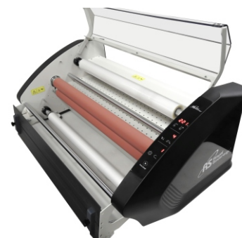
Ease of Access Loading