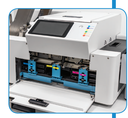
Clamshell design offers easy front access to ink tanks and paper path