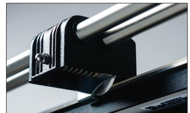
Dual stainless steel guide rails eliminate cutting head swivel