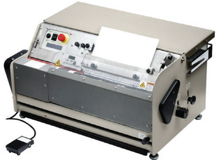
Side Lay Tool