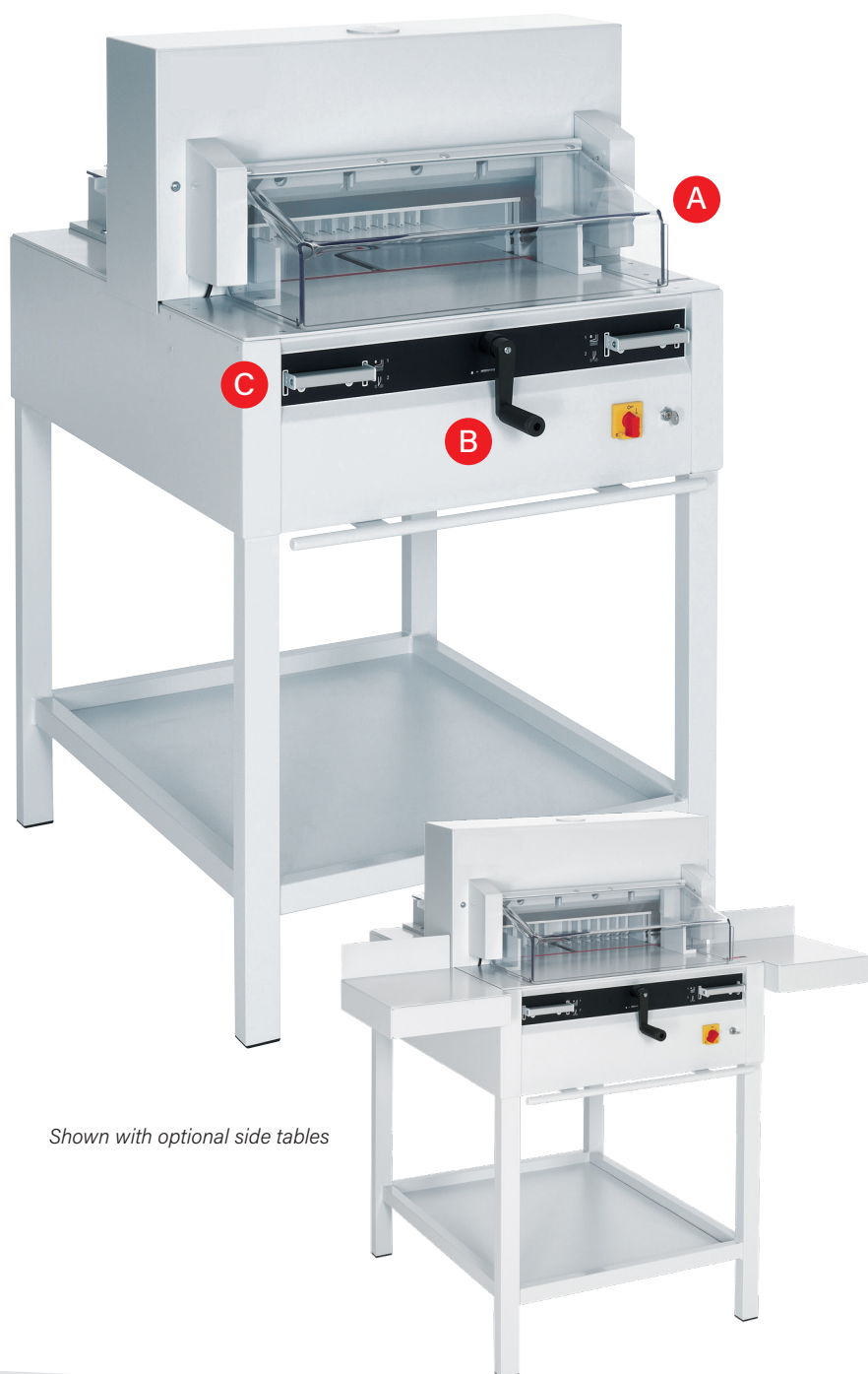
Shown with optional side tables

Fully automatic cutter with electric blade drive, automatic clamp, and EASY CUT blade activation.