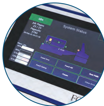
Touchscreen Control Panel For centralized operation and easy adjustments