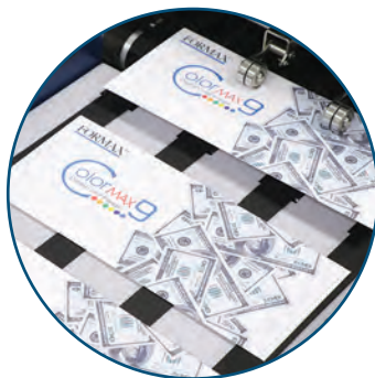
Processes up to 10,000 #10 envelopes per hour: Production speeds in a robust tabletop printer