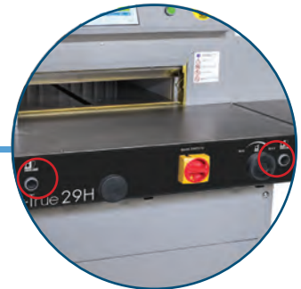
Two-Hand Operation Automatically engages clamp and blade keeping hands away from the cutting blade