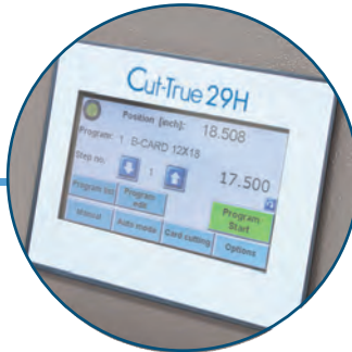
Touchscreen Control Panel Allows for programming up to 100 jobs and 100 steps