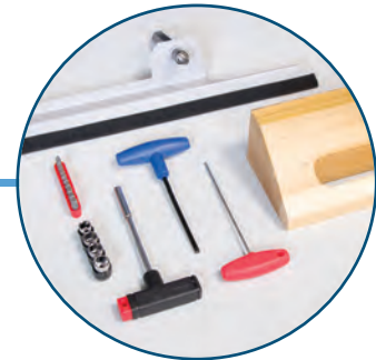
Blade Change Safety Tool Kit Change blades safely and easily, and make adjustments