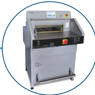
Standard Model Compact model without optional side tables