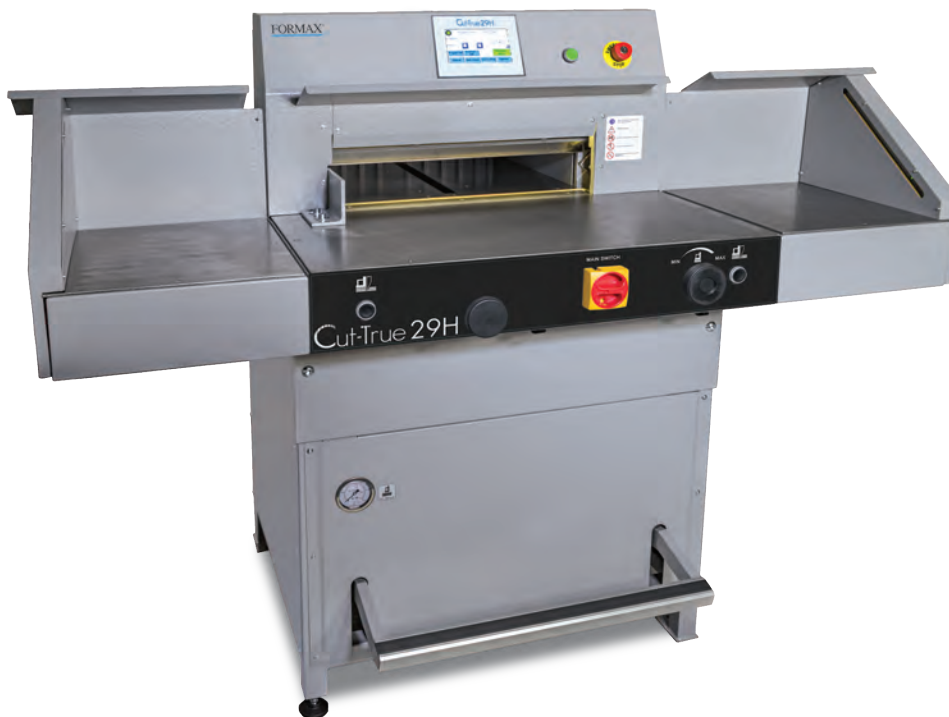
Shown with optional wide side tables