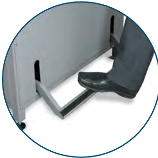
Foot Pedal Pre-Clamp Holds paper to check alignment prior to cutting