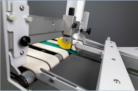
Flex Belt™ Technology