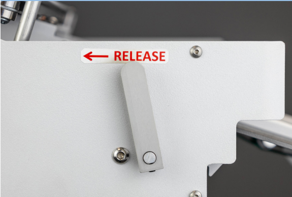
Secure Latch™ alignment system