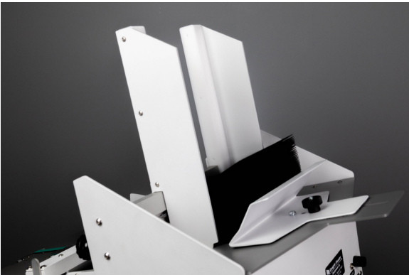
New hopper design with built in jogging of media.

Revolutionary features for an ever changing industry... the DF-330, our newest feeder and bench mark for production printing. The DF-330 joins the progressive line of digital printer feeders from Straight Shooter with more new features that will enhance production. Flex Belt™ technology has been designed and incorporated into the DF-330 to eliminate skew and ensure accurate envelope delivery from start to finish. A simplified hopper design and chassis T system make for easy set up and rapid job changeovers from size to size and job to job. A new on board jogging system “jostles” envelopes down to the last piece for care free operation. The new Secure Latch™ system secures the feeder for printer perfect alignment and print registration, every time! All this and more coupled with our standard features and patented Buckle Separation™ and Floating Acceleration Table™ will make your production printer... productive!