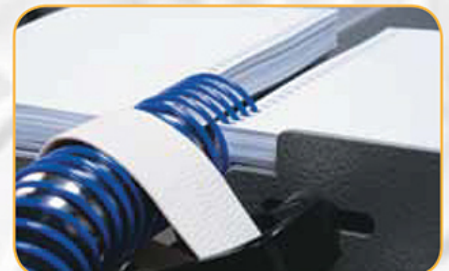
Front Support Table allows thicker books to be opened in half for easier insertion.