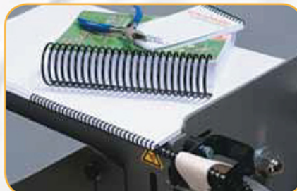
Full Range – From the smallest notepad to the largest calendar. Diameters 6-50 mm.