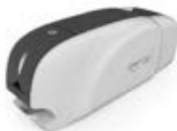
Dual sided ID CARD PRINTER