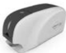
Single sided ID CARD PRINTER