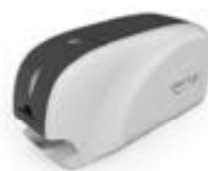
Rewritable ID CARD PRINTER