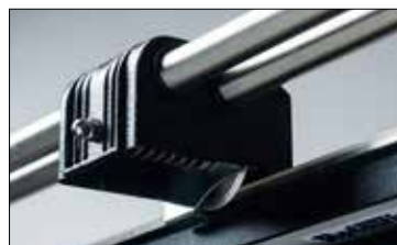
Dual stainless steel guide rails eliminate cutting head swivel