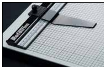
Solid 25mm laminate grid baseboard with cross hair paper size markersboards.