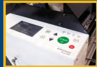
Easy-to-use Color Screen & Controls