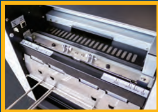
Simple-slide paper size adjustment