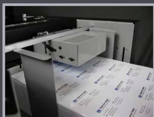
Top Feed Vacuum System