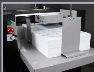
Large 8" Capacity Pile Feeder