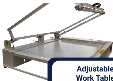
Adjustable Work Table